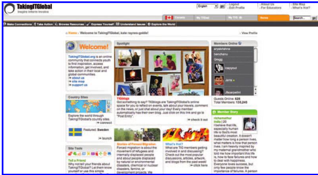
Figure 4 The TakingITGlobal.org Home Page.